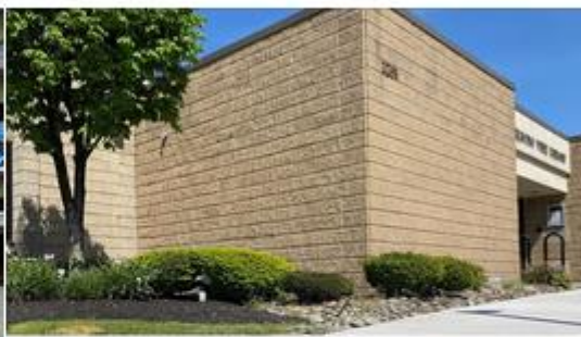
Marlboro Free Library, Marlboro

The Saugerties Public Library was established as a Carnegie Library in 1915, and the old fireplace is framed with tiles by the Maravian Pottery and Tile Works, which depict the story of Rip Van Winkle.