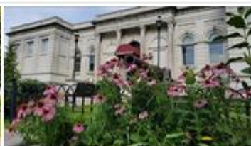
Adriance Memorial Library, City of Poughkeepsie

At one point, the North Chatham Free Library was believed to be the smallest library in NY. That "Little Library" still stands next to the current building and has been beautifully renovated as a meeting space and reading room.