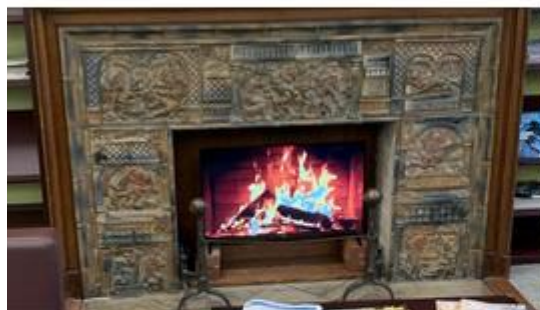
Saugerties Public Library, Saugerties

#hudsonvalley #publiclibraries #NYShistory #LibrariesAreForEveryone #nationallibraryweek