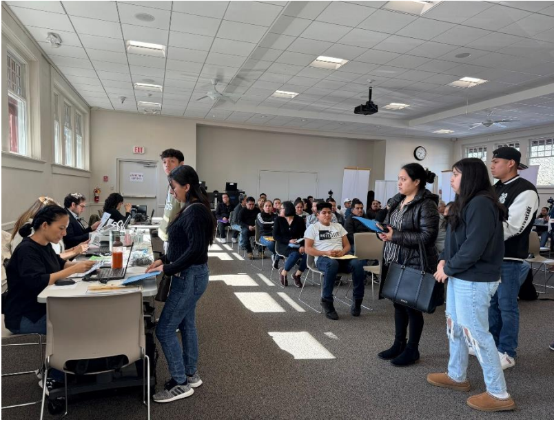
Above: Area residents accessing services from the Consulate General of Mexico in the MHLS Auditorium

individuals were served over five days and 382 documents were processed.