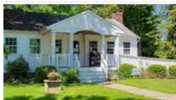
North Chatham Free Library, North Chatham

At one point, the North Chatham Free Library was believed to be the smallest library in NY. That "Little Library" still stands next to the current building and has been beautifully renovated as a meeting space and reading room.