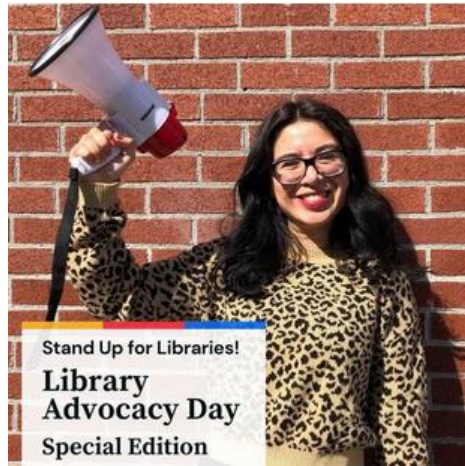
Above: The staff at the Howland Public Library in Beacon did a great job using Instagram to help get the word out about state-level advocacy this year!

we've had a lot of work to do and we appreciate your continued help.