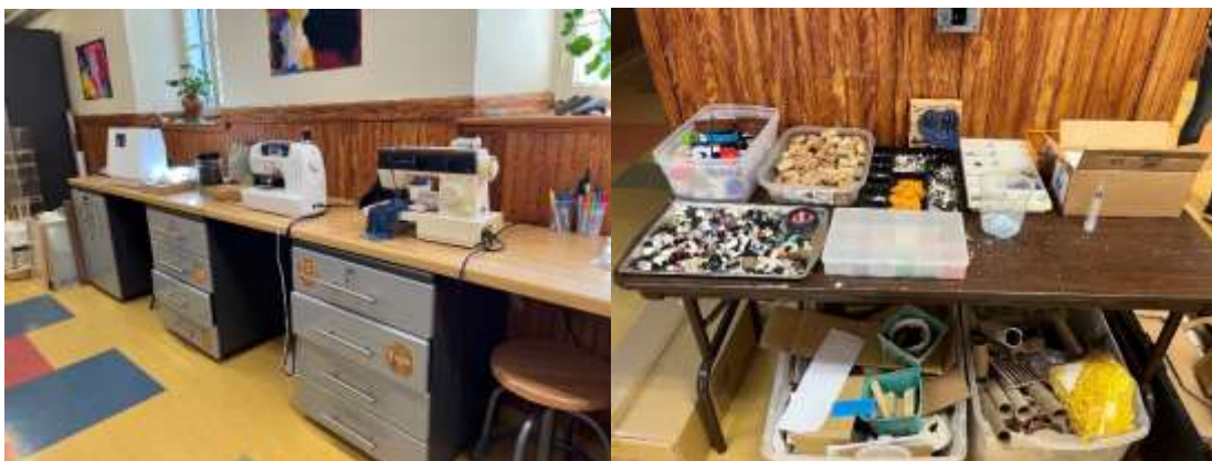
(l-r: new sewing machine stations and materials for upcycled crafts in the new makerspace at the Morton Memorial