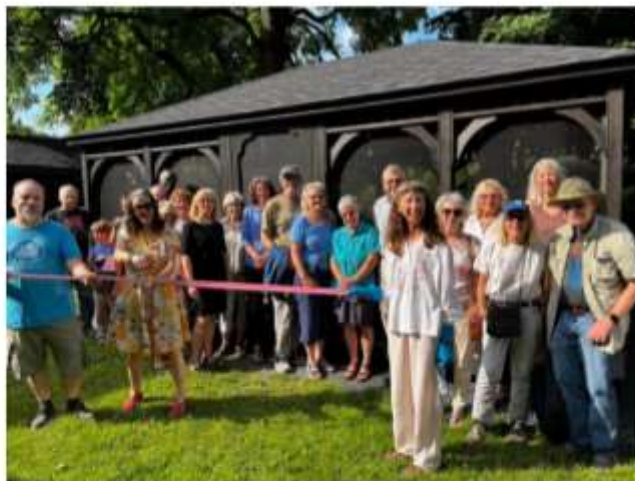
The Rosendale Library celebrated the opening of its new outdoor program space on June 15th. The screened, 14-foot-by-20-foot gazebo is situated under a canopy of large old maple trees and next to the library building. It will be the location of many of the library’s programs such as the weekly story hour and the monthly slow jam for string instruments and the library’s summer reading program. The gazebo building was funded in part through a New York State Library Construction Grant. The gazebo will have a Wi-Fi router provided through the Beyond the Library Wi-Fi access point project. This program was supported with federal American Rescue Plan Act (ARPA) funds allocated to the New York State Library by the Institute of Museum and Library Services (IMLS).