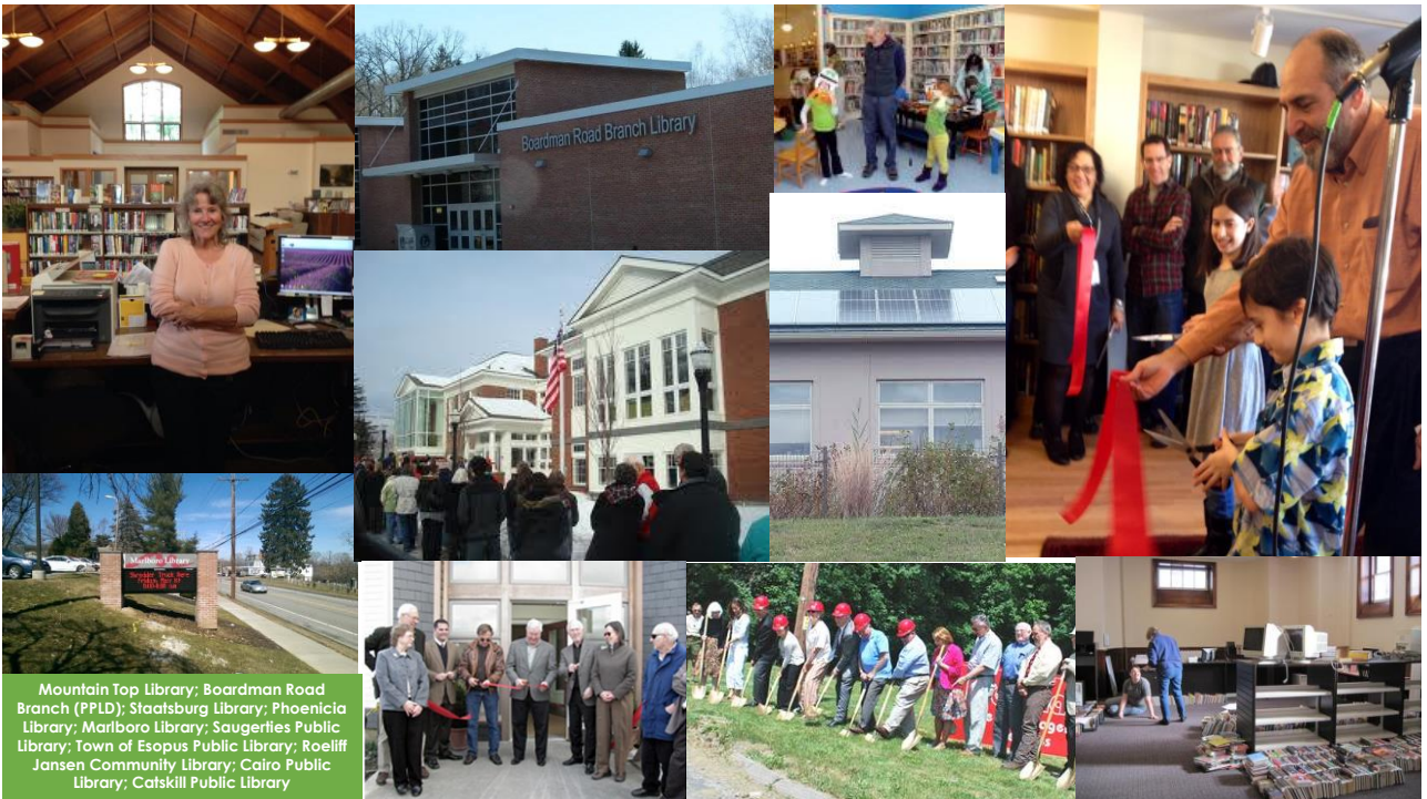
Mountain Top Library; Boardman Road Branch (PLD); Staatsburg Library; Phoenicia Library; Marlboro Library; Saugerties Public Library; Town of Esopus Public Library; Roeliff Jansen Community Library; Cairo Public Library; Catskill Public Library